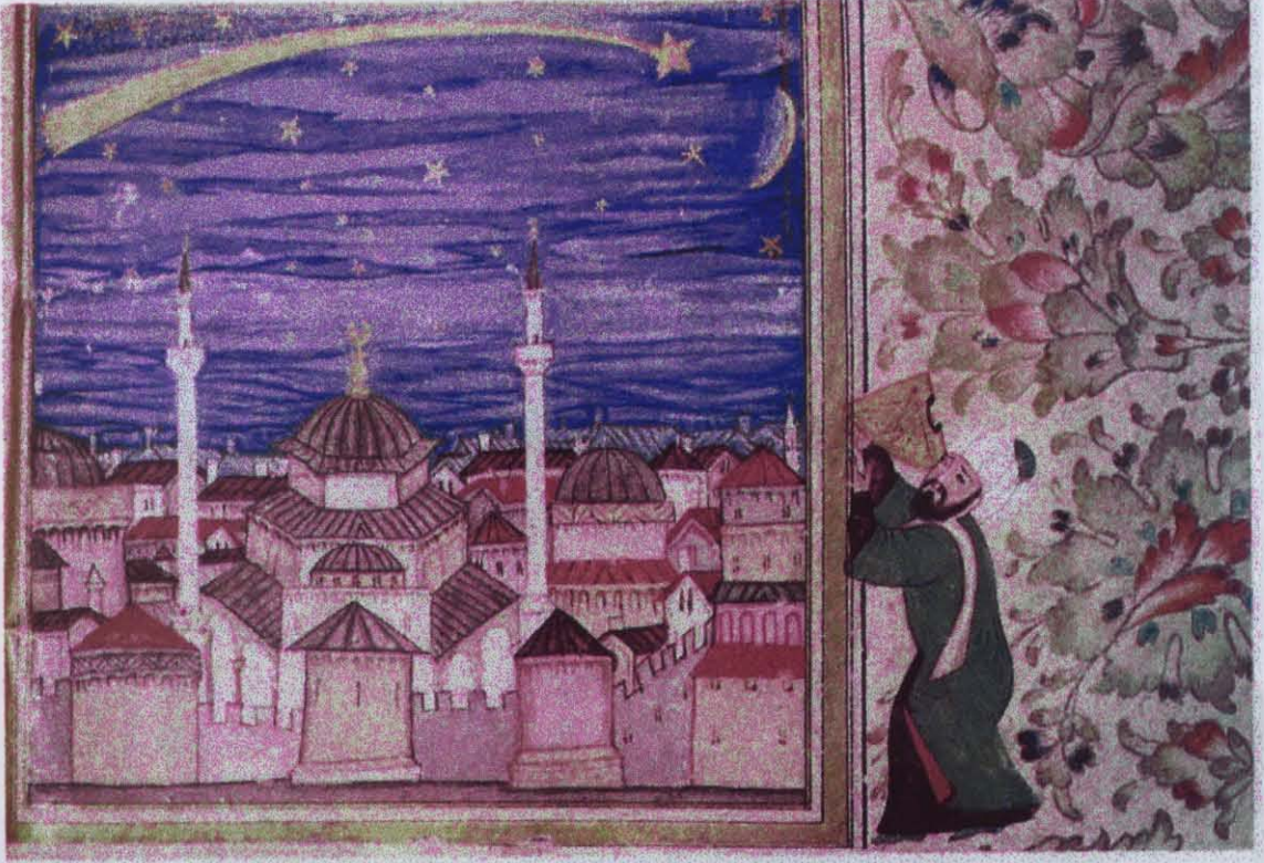
Figure 2 : İslam ve İlim p.125