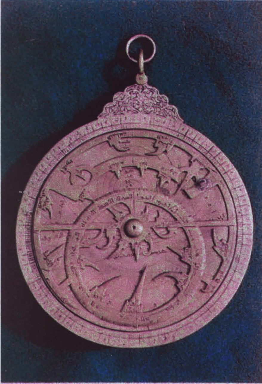
Figure 1. İslam ve İlim p.120