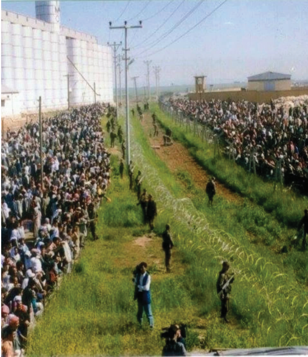
Figure 6: A bairam day on the borderline between Turkey and Syria in Ceylanpınar.