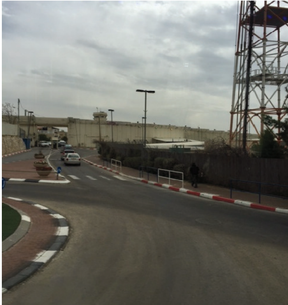
Figure 5: El Halil (Hebron), West Bank, Palestine. (February 2017.)

Recently, states have benefited from technology especially in border construction practices. The wall building practices of USA, Israel, and Turkey should also be considered in this context. Together with the wall, the borders are strengthened with technological watchtowers and drones, and possible violations can be detected immediately.