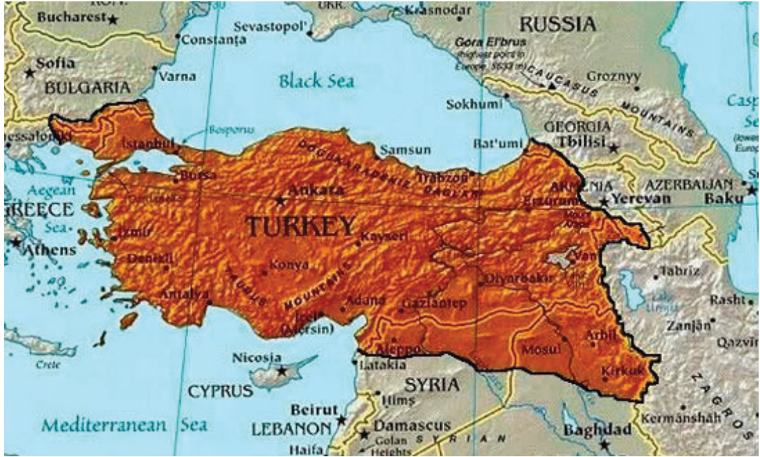
Figure 1: The map of Turkey envisioned before the Ankara Treaty (1921). 1