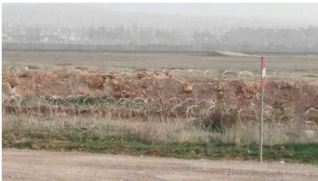
Figure 4: The wall on the borderline between Mürşitpınar and Kobane. (January 2017)

The construction of the wall will be completed in the first half of 2017, Işık said when visiting the Hatay province on the border with Syria. Around 520 kilometers is left, he added noting that construction of the second part of the wall – 200 kilometers – has already been launched. 10