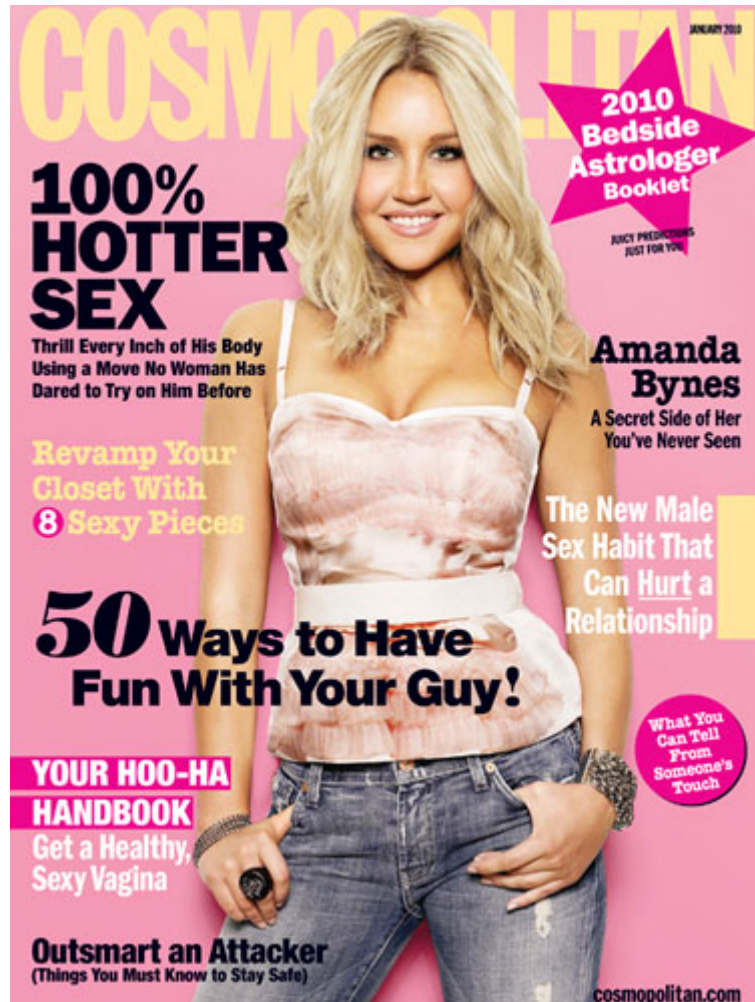
Illustration 13. Front Cover of ST January 2010