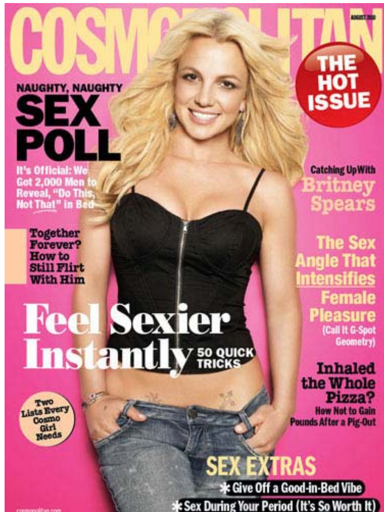
Illustration 20. Front Cover of ST August 2010