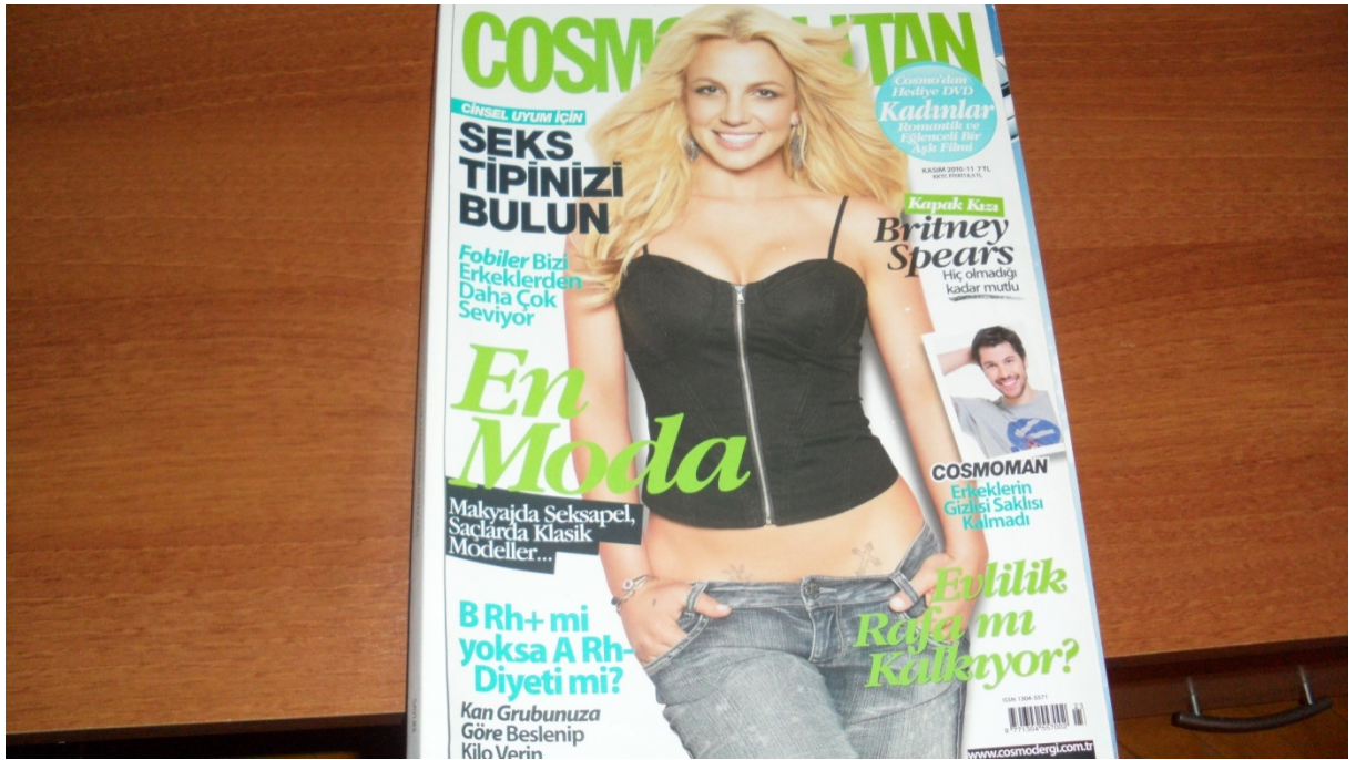
Illustration 11. Front Cover of November 2010