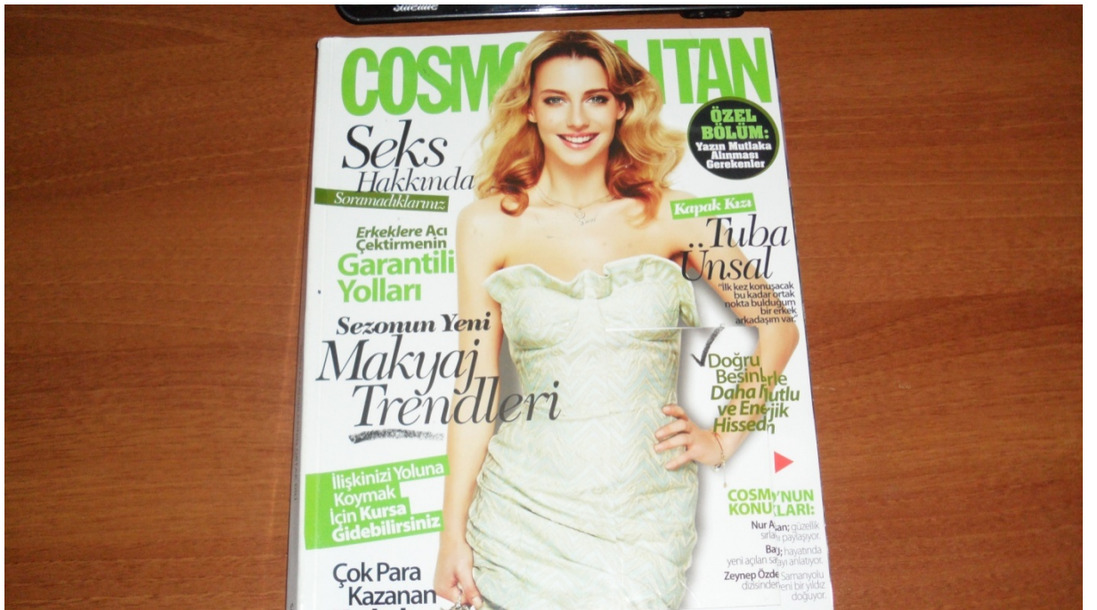
Illustration 5. Front Cover of May 2010