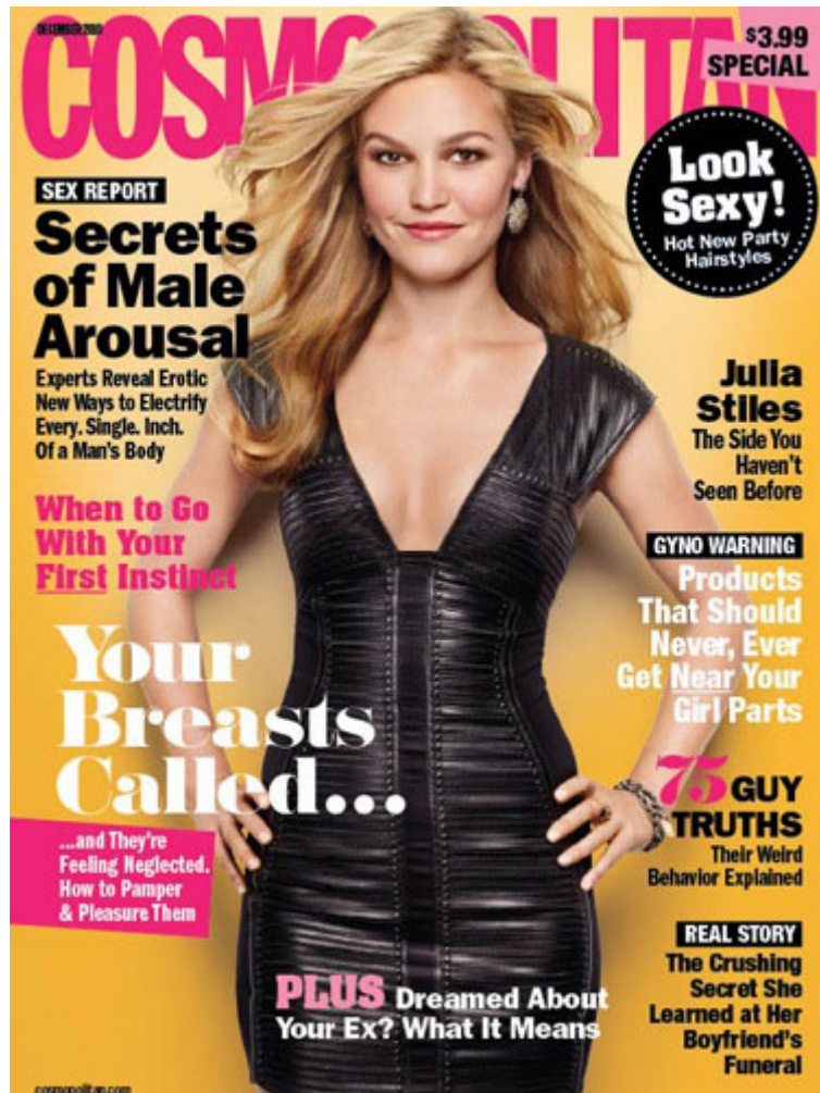
Illustration 24. Front Cover of ST December 2010