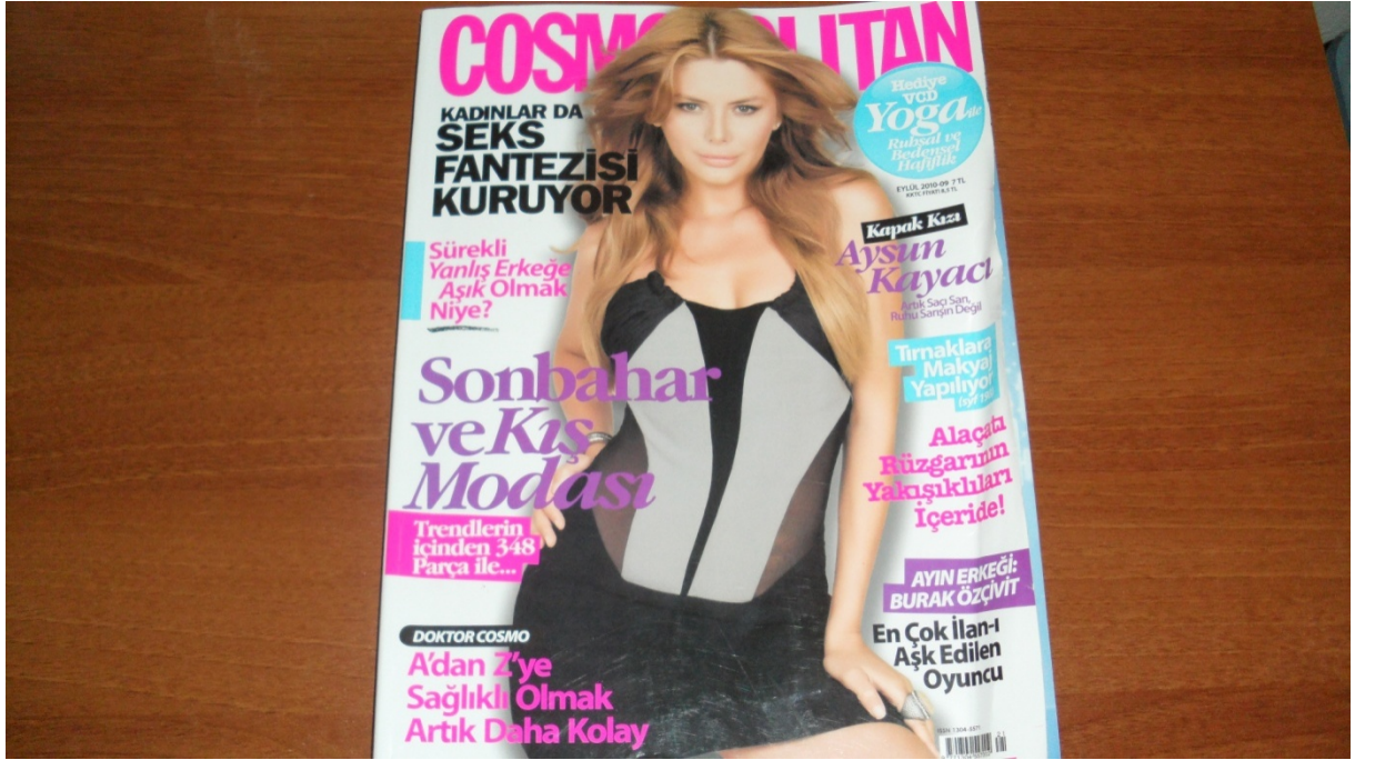
Illustration 9. Front Cover of September 2010