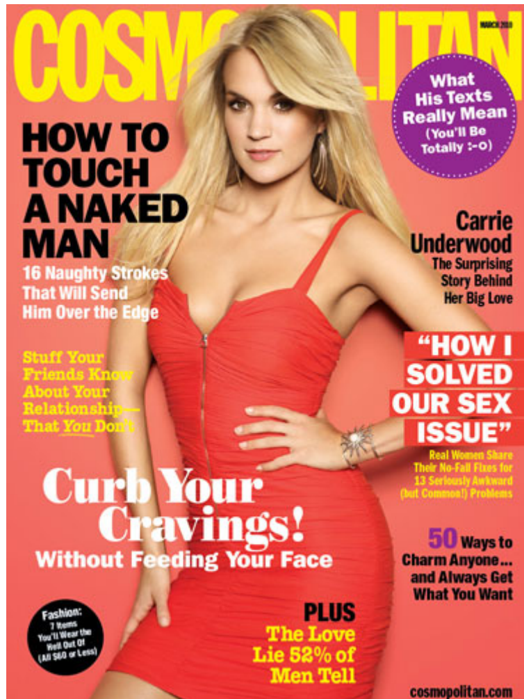
Illustration 15. Front Cover of ST March 2010