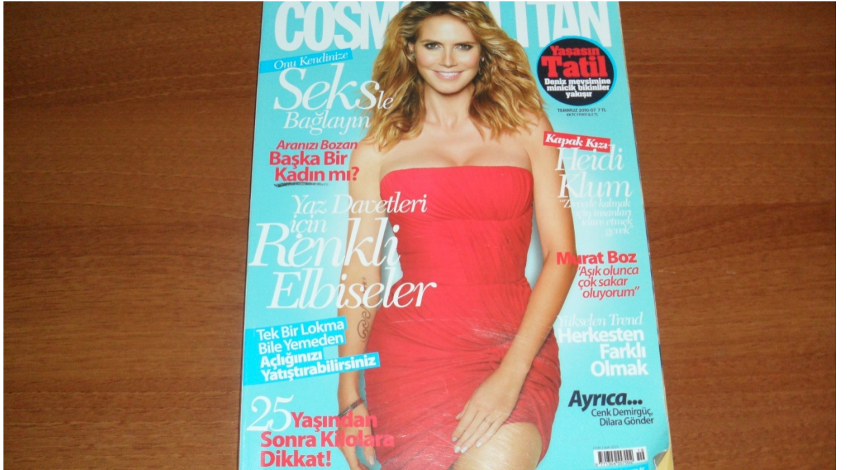
Illustration 7. Front Cover of July 2011