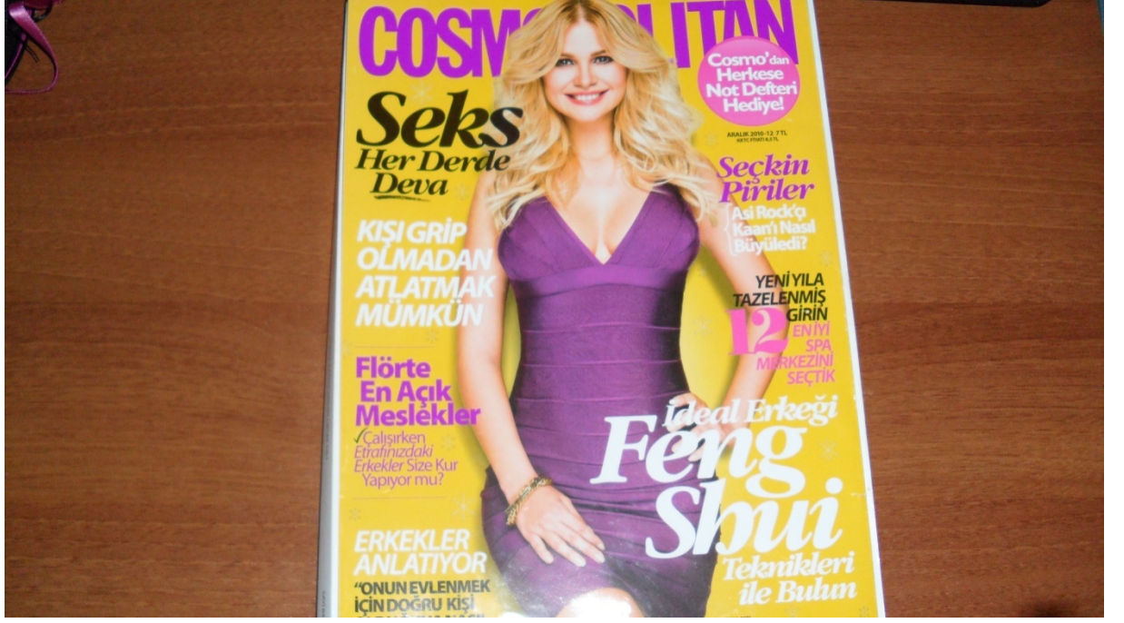
Illustration 12. Front Cover of December 2010