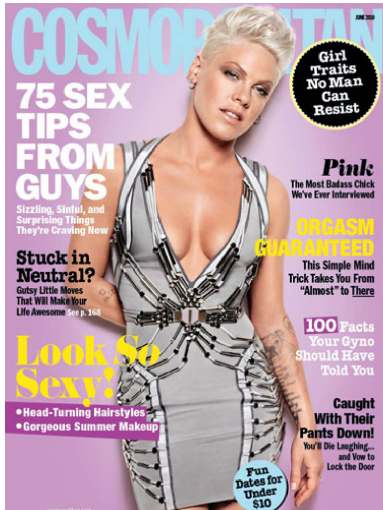
Illustration 18. Front Cover of ST June 2010