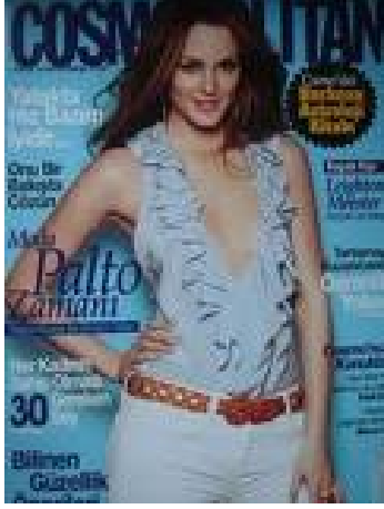
Illustration 1. Front Cover of January 2010