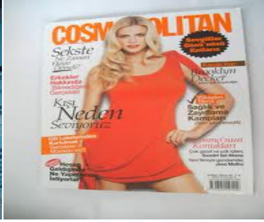
Illustration 2. Front Cover of February 2010