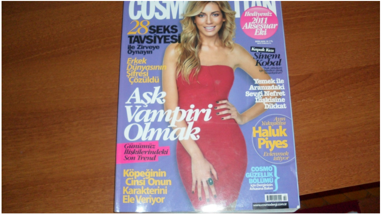
Illustration 10. Front Cover of October 2010