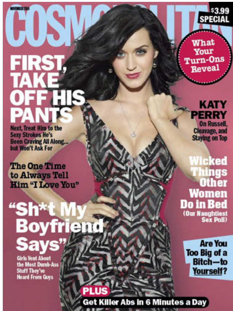
Illustration 23. Front Cover of ST November 2010