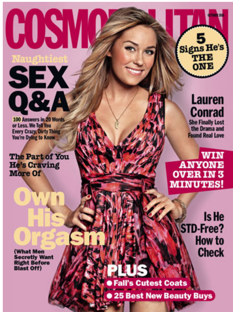
Illustration 22. Front Cover of ST October 2010