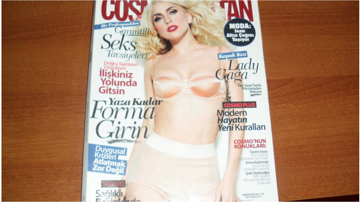
Illustration 4. Front Cover of April 2010