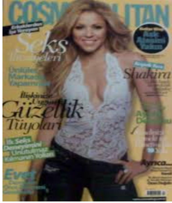
Illustration 8. Front Cover of August 2010