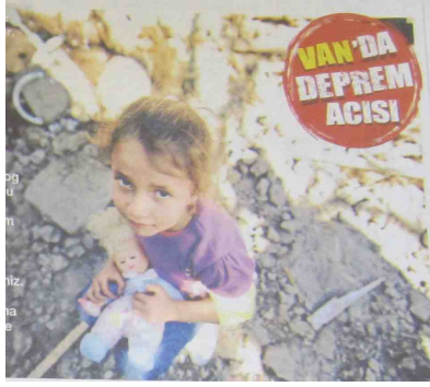
Figure 5 Victim children depicted Habertürk , 25 October 2011, Van'da Deprem Acısı Special Section, p.20

It is noticed that special earthquake sections (Fig.4 and Fig.5 are examples) principally rely on dramatic misery stories. These news sections use distinct visual effects or logos where detailed personal stories of the victims are narrated with specific literary preferences; such as usage of past tense, inverted sentence structures, story lines of rise and fall of the characters. 30 These stories are combined with children photographs and mostly the gazes of children are addressed towards the audience. Similar to Yunus's picture, the victims are aware that their photographs are taken and invite the audience to a civil contract (Azoulay, 2008), a public sphere of being seen. In some of the visuals as a technical preference, context or background is blurred, shallow focus is used, and focus is set on the character to highlight the feelings of the people photographed (see figure 5) that summons the audience to identify with the suffering and mourning experience of the victims. It is also nourished by a popular photographic genre similar to National Geographic magazine (Lutz & Collins, 1993) that depicts poverty and hunger or that portrays the children of the underdeveloped world in need. Yunus's photograph also fits into this cluster.