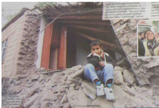
Figure 4 Victim children depicted Sabah Cumartesi , 29 October 2011, Van Depremi Special Section, p.20

What makes some victims ideal whereas some less ideal in suffering representations? At first glance, age, gender (female emphasis) and being a family member seem to form the individualized victim stories ideal to identify with, since they are constructed on universal concepts. Especially children are associated with innocence and the creation of innocent victims has a “depoliticizing” effect. In the following photographs (see Fig. 4 and Fig. 5), the setting is composed of demolished houses, the children are extremely vulnerable and weak in this context, look back to us and invite to a relationship, like Yunus did in his popular iconic picture. Yunus’s photograph can be considered in this cluster of children photographs.