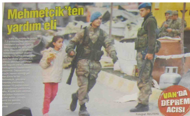
Figure 9 Male figures helping young female figure Habertürk , 25 October 2011, Van'da Deprem Acısı section, p.22

Mobilization, state of emergency and help aids news bring us to another cluster of visuals that construct who the heroes are. In general, heroes are men in uniforms. Either policemen or gendarme assure order in aid distribution or protect vehicles carrying help aids. Moreover male figures become heroes by saving victims, helping children, or women. Rescue teams, the military, the gendarme or the police are male subjects to save and protect Van that is in a way feminized, portrayed in need or infantilized (Fig. 9 and Fig.10).