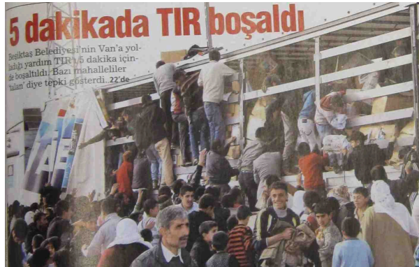
Figure 8 Anonymous victims looting Habertürk , 29 Oct 2011, front page

Distance is set and solidified with the news on teachers. Every newspaper made special news on teacher stories. Teachers are constructed as ideal victims who sacrifice their lives for the virtuous purpose of teaching in a far away place. Even one newspaper calls the teachers as martyrs. These news especially emphasize teachers' birthplaces or where their family live or where their funeral will be buried. In a way, teachers are constructed as the outsiders who had sacrificed their lives for a divine purpose. Furthermore, the teacher identity constructs how Van is a far far-away place