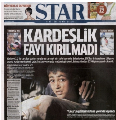
Figure 3 Yunus in headlines, brotherhood emphasis Star , 25 October 2011, p.1

stated. Why is specifically a discourse of brotherhood is preferred in an aftermath disaster news discourse? As it can be seen; brotherhood is expressed as something to be felt, out there, clearly noticed and undamaged in spite of something not expressed with words. It can be argued that such news imply that the brotherhood is secured in spite of the ethnic difference of the citizens, or the hate discourse became visible in social media, or the shared history of conflict. It is implied that at the end of the day, we are brothers on good days and bad ones.