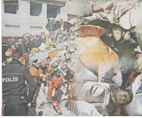
Figure 2 Yunus in the context of debris Akit , 25 October 2011, p.1

As discussed, a discourse on unity of nation is widespread in Van earthquake news. The compassionate subject is constructed as the nation, Turkey as a whole, which is mobilized no matter what, towards the painful suffering object, Van, in the dominant news discourse. Yet this relationship itself is political, because of the difference and hierarchy between the two parties. The subject is active and content, whereas the object is helpless and stuck under the rubble. Furthermore, this “no matter what” becomes problematic because of its overemphasis as if to cover up something threatening this unity. It can be argued that an expectation of discrimination is absently present in the discourse. News clustered around the brotherhood discourse reveals the ambivalence and hierarchy more visible from a critical perspective to see the formation of self-evident myths.