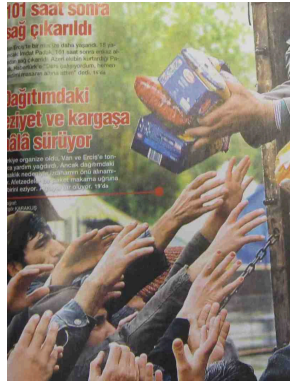
Figure 7 Anonymous victims receiving aids Habertürk , 28 Oct 2011, Front page

geography is an unsafe place and the aids may be going to wrong hands. It also constructs a victimhood that is unfortunate yet under-civilized in manners (see Fig.7 and 8). In a way the victims are portrayed as savages, who behave in a Hobbesian state of nature, which later legitimizes the state of emergency and military actions in the disaster area.