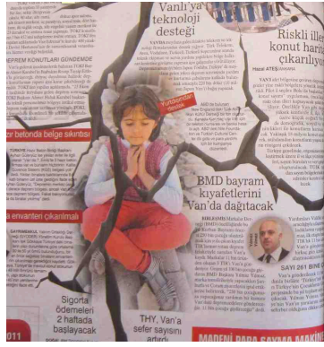
Figure 10 Young female figure in between fault line visuals Sabah , 25 October 2011, Economy and Finance section, p.8

As seen explicitly in Fig 9 and Fig 10, in some visuals the victims to be saved or helped are represented via very young female figures. In the first picture, there are four male soldiers helping a victim girl in Van, to restore order again. The second picture is the news in finance and economy section, that tells about the aiding organization of the state and big corporations. In the latter visuals of fake broken fault lines surround a victim girl. In Disappearing Acts , Taylor (1997) works on the gendered construction of the state via photographs to show how masculine positions are constructed to form a national identity. She argues that heroic military officers rescuing young women inspires steadfastness and embodies communal ideals of “we” that cling together to restore (Taylor 1997, p.9). To her, feminizing populations in representations makes military intervention look necessary even desirable (p.61).