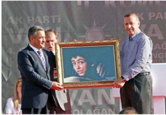
Figure 14 JDP General Congress in Van July 2012, The Prime Minister and JDP City Council on stage