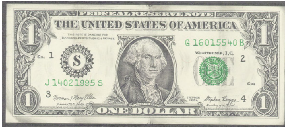
Photograph 2. A Boggs Bill

While some artists attempt at escaping the system through their practice, a number of independent institutions or artists refuse to be a part of the sponsorship system, rejecting private sector support. They usually fundraise through the independent funding institutions system in order to escape censorship and not be a part of a company's strategy of clearing its label through art. Companies sponsor art for two main reasons: 1. When a correct connection between the company's products or services and the sponsored event is established, the sponsored event becomes a successful marketing campaign although or insofar as it is properly masked. 2. In the case where there is no direct connection between the company's goods and services and the sponsored event, the relationship established with art through generous support promotes the company's righteous image (Chin-tao Wu, 219). Art museums and biennials are in such a privileged position that having an interrelated image with those institutions are overt indicators of social prestige and power. Another aspect of sponsoring art institutions is the belief in art-related institutions' apolitical status, as art is for the sponsoring company a highly aesthetic practice free from politics. Chin-tao Wu recalls the saying of a high-level manager of one of New York's prominent art museums: "We are not political." (223) Sponsoring art is usually included in