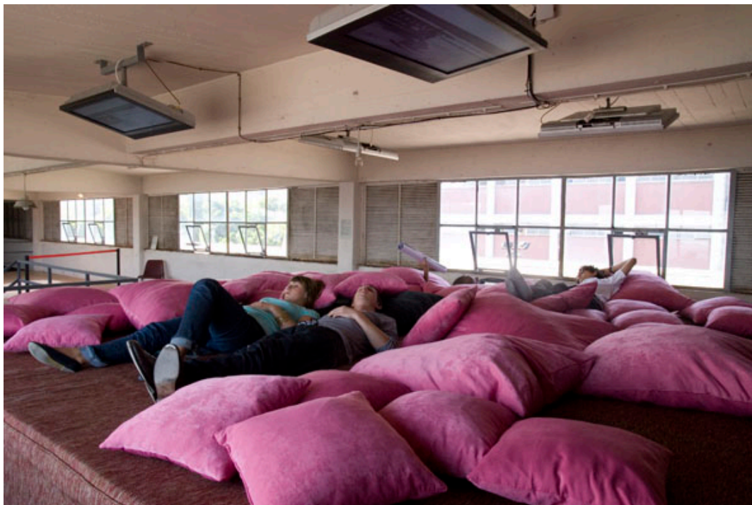
Photograph 3. “Dream House,” 10 th Istanbul Biennial, 2007.

Hou stated that “[a] biennial of contemporary art seeking to be engaged with the urban life of Istanbul also should not sleep. Instead, it should offer the public a space to spend their nights and to enjoy the beauty of the city.” (“Dream,” 410) The Dream House cleverly offered a night experience to both local and international audience, with comfortable cushions included in one of the artworks, chairs and headphones in another, alongside the Topkapı Palace and sea view as a bonus. Hou justified the project both as a revolt against the formal working hours, the bureaucratic order in which art is consumed as an everyday commodity and as an “antidote to normality”: “Instead of promoting efficiency, people are invited to experience the effective, the spiritual, the sensitive. Contemplation, dream, fantasy and love are indispensable in a fully lived urban life.” (“Dream,” 410) Thus, Dream House was supposed to offer this spiritual, sensitive night and day experience where the visitor was invited to contemplate, share and live her/his fantasies.