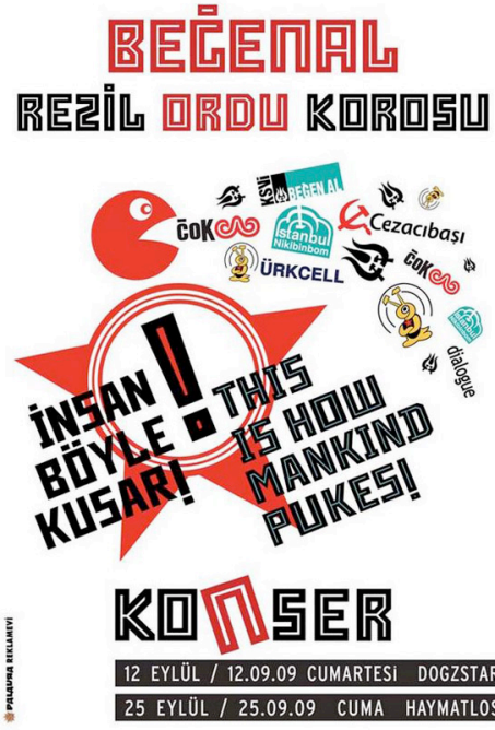
Photograph 5. “Beğenal”’s Alternative Biennial Poster (left)