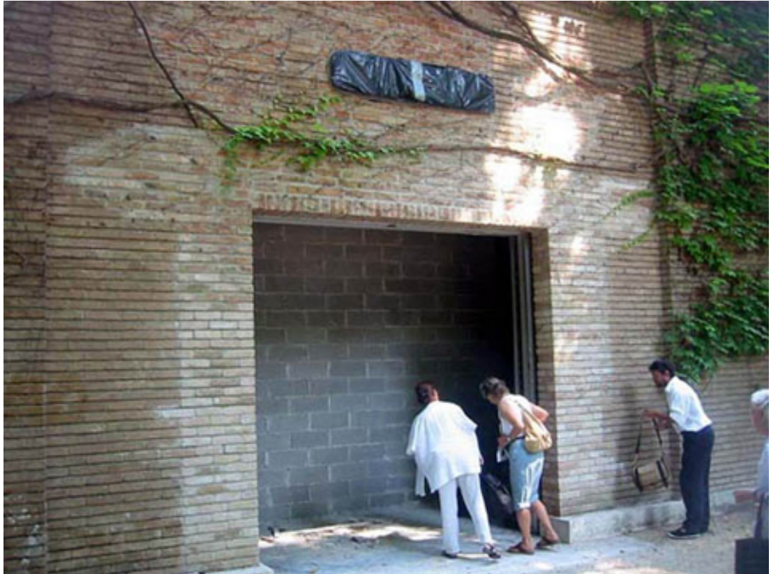
Photograph 1. Santiago Sierra, “Wall Enclosing a Space,” 2003.

within the context of the European Union especially, the work was subject to political discussion and gave a hard time to the visitors in making sense of the closed doors of a national pavilion.